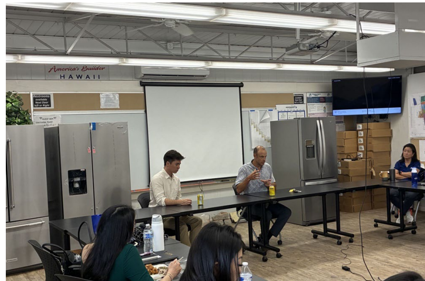
Representative Evslin and Sterling discussed the efforts of legislators and policymakers to make housing more affordable.