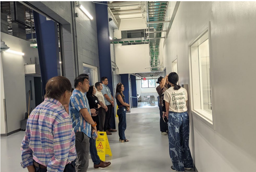
The Fellows also visited the Wahiawa Value-Added Product Development Center (WVAPDC) to learn about a facility dedicated toward helping local food-based entrepreneurs start up and scale.