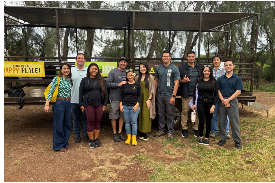
The Fellows toured Kahuku Farms, observing the different varieties of fruits and vegetables, including acai, cacao, apple banana, papaya, avocado, kalo, and eggplant, and learned about the work that goes into farming.