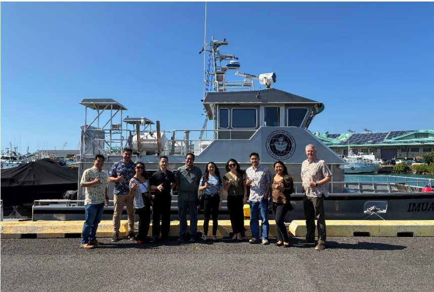
The Fellows visited the UH Marine Center and learned about commercial fishing and ocean-based scientific research, and how vessel and port maintenance, logistics, and workforce challenges impact objectives.