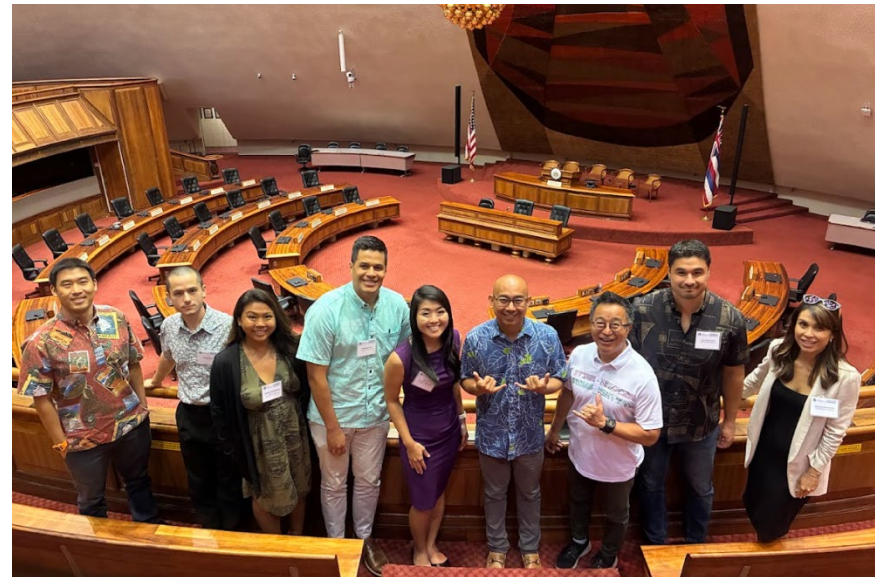
Senator Wakai and Representative Ilagan also discussed the legislative process, what it takes to become an elected official, and how young professionals can show leadership.