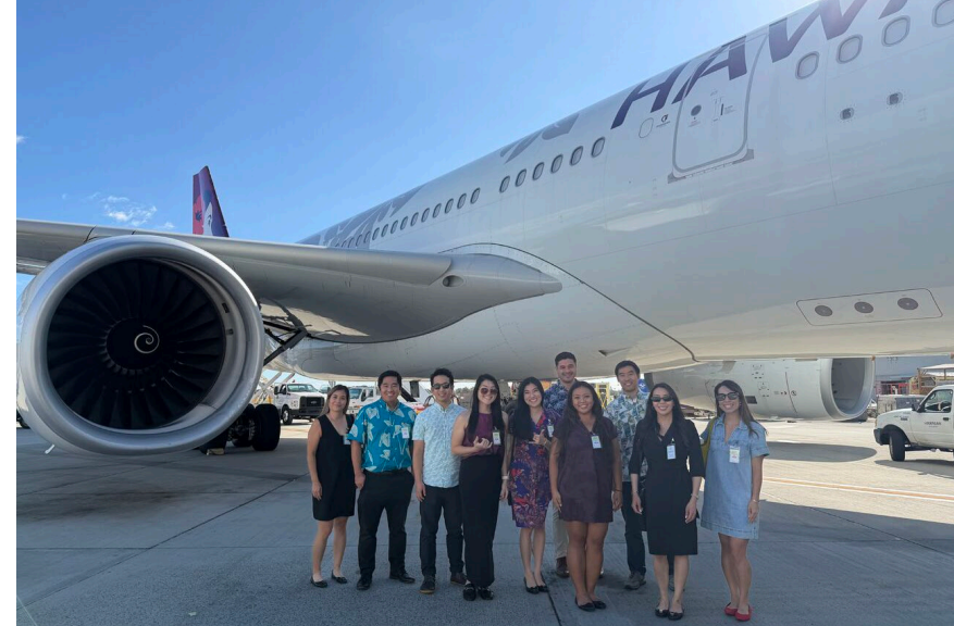
The Fellows toured Hawaiian Airlines' maintenance hangar and learned about what goes into keeping airplanes safe. The Fellows also visited the Systems Operations Control Center and saw FAA dispatchers at work.