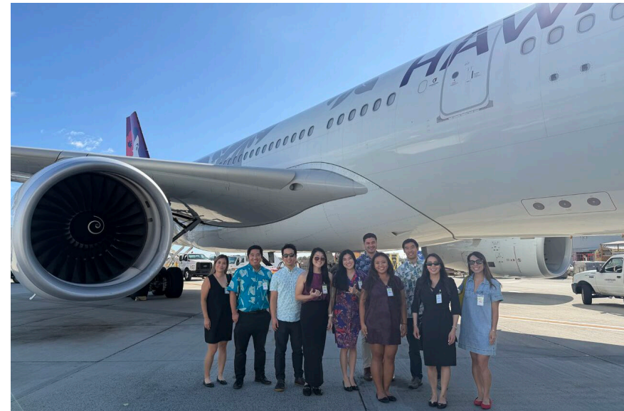
The Fellows toured Hawaiian Airlines' maintenance hangar and learned about what goes into keeping airplanes safe. The Fellows also visited the Systems Operations Control Center and saw FAA dispatchers at work.