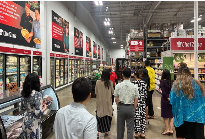
The Fellows learned about Y. Hata & Co.'s retail and wholesale business lines and were treated to a chef-prepared meal in Chef Zone's community room.