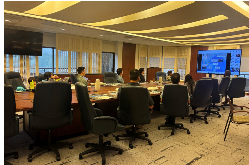
Most of the originally scheduled presenters were able to join virtually. They discussed the role the military plays in sparking local economic growth and supporting the community after natural disasters.