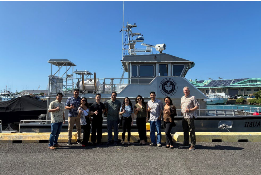
The Fellows visited the UH Marine Center and learned about commercial fishing and ocean-based scientific research, and how vessel and port maintenance, logistics, and workforce challenges impact objectives.